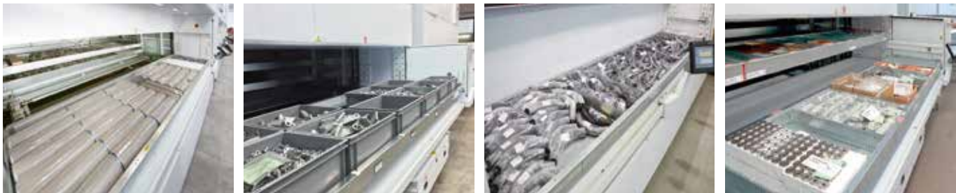
SINGLE INTERNAL DELIVERY SINGLE EXTERNAL DELIVERY DUAL INTERNAL DELIVERY DUAL EXTERNAL DELIVERY

Dual delivery is the ideal configuration for a fast-paced picking operation.